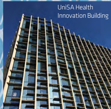
UniSA Health Innovation Building

Work is progressing well on the University of South Australia's Health Innovation Building. With the façade now almost complete, work is well underway on the interior fitout and the realisation of the external areas including the stair link to the Morphett Street Bridge and the combined 'Urban Park' on North Terrace. The combined consultancy team is working closely with Hansen Yuncken to deliver occupation by early 2018 on schedule.