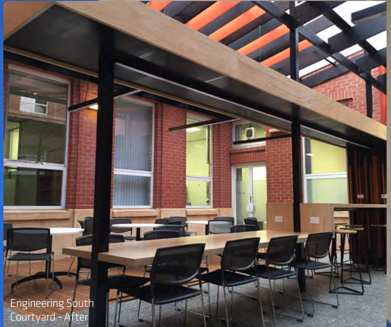
Engineering South Courtyard - After