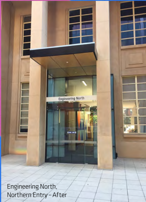
Engineering North, Northern Entry - After