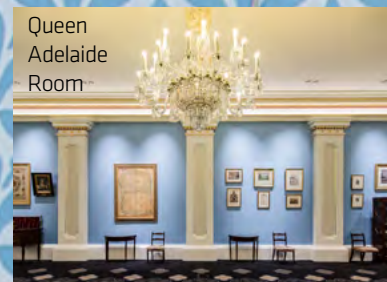
Queen Adelaide Room