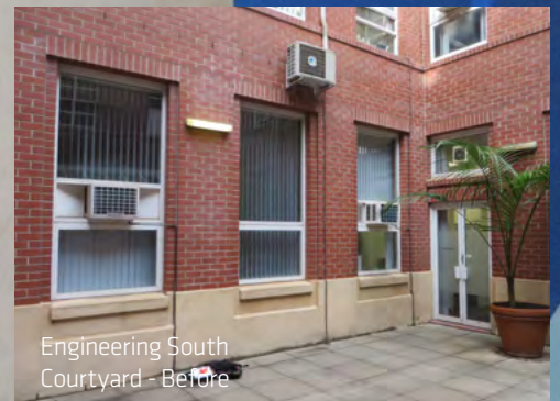
Engineering South Courtyard - Before