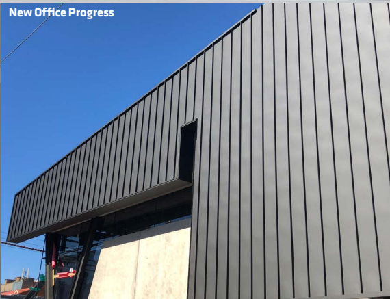
New Office Progress