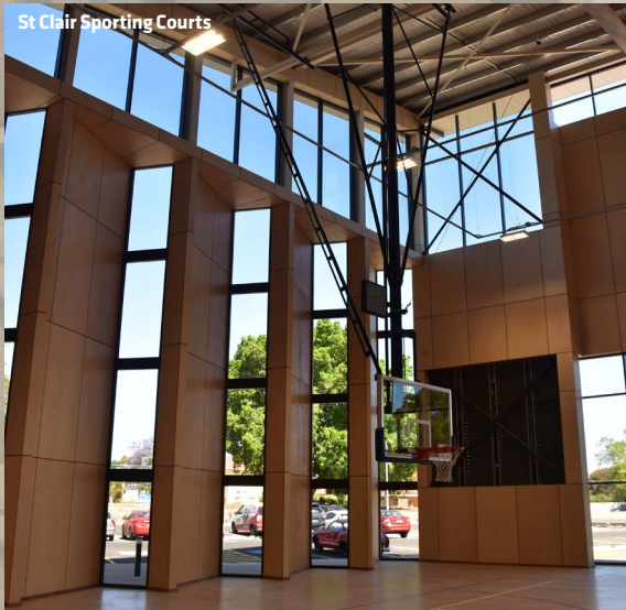
St Clair Sporting Courts

Until next year, happy holidays from all of us at SPA!