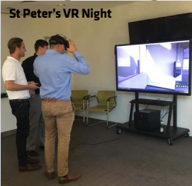
St Peter's VR Night