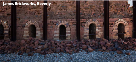
James Brickworks, Beverly