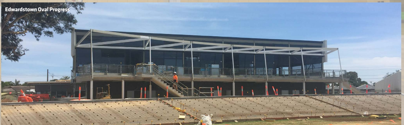
Edwardstown Oval Progress