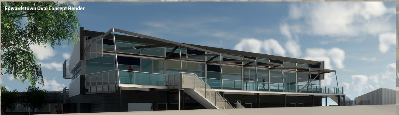
Edwardstown Oval Concept Render