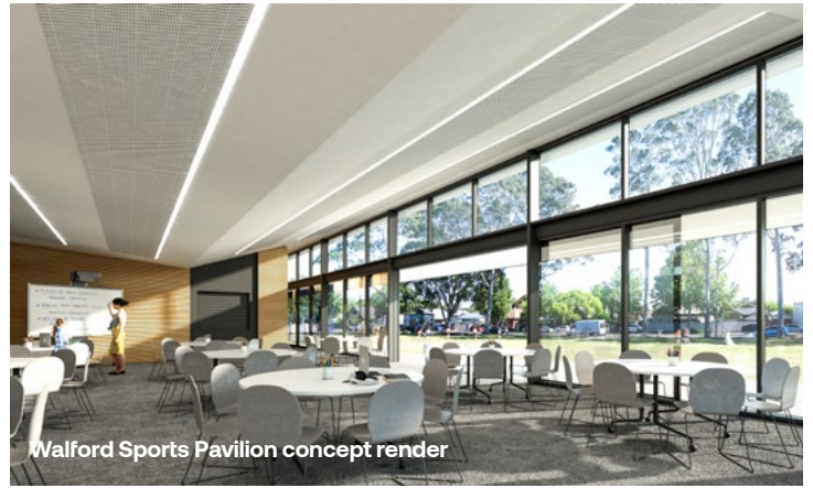
Walford Sports Pavilion concept render

#78 This quarter we are featuring a sporty school pavilion and some cute faces from our time spent working from home. We hope you enjoy our regular update of office news and keep safe (and warm) through the winter months - happy reading!