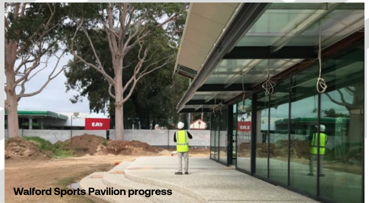
Walford Sports Pavilion progress