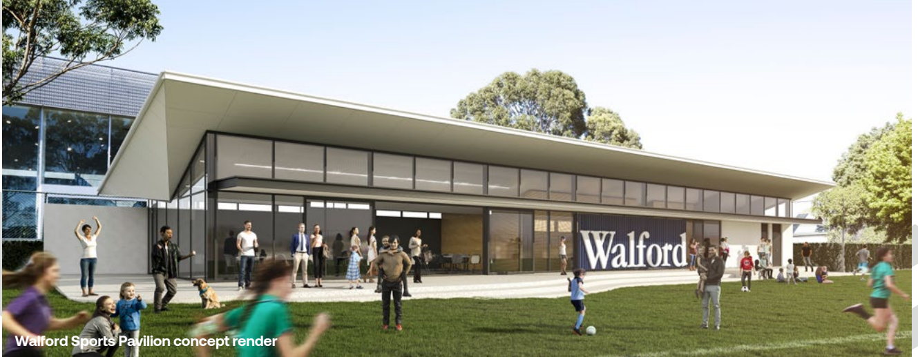
Walford Sports Pavilion concept render