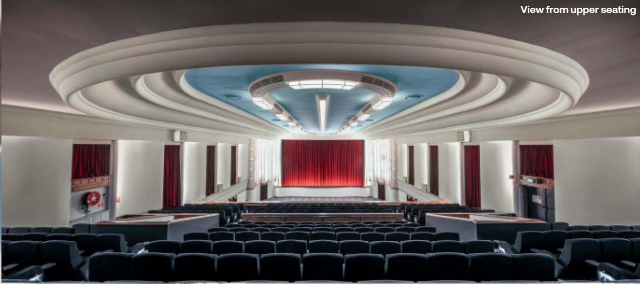
View from upper seating

#82 Although it's cold outside, we invite you into the warm interior of the Regal Theatre upgrade, recently completed by our heritage team.