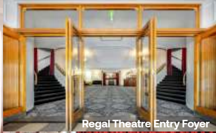
Regal Theatre Entry Foyer