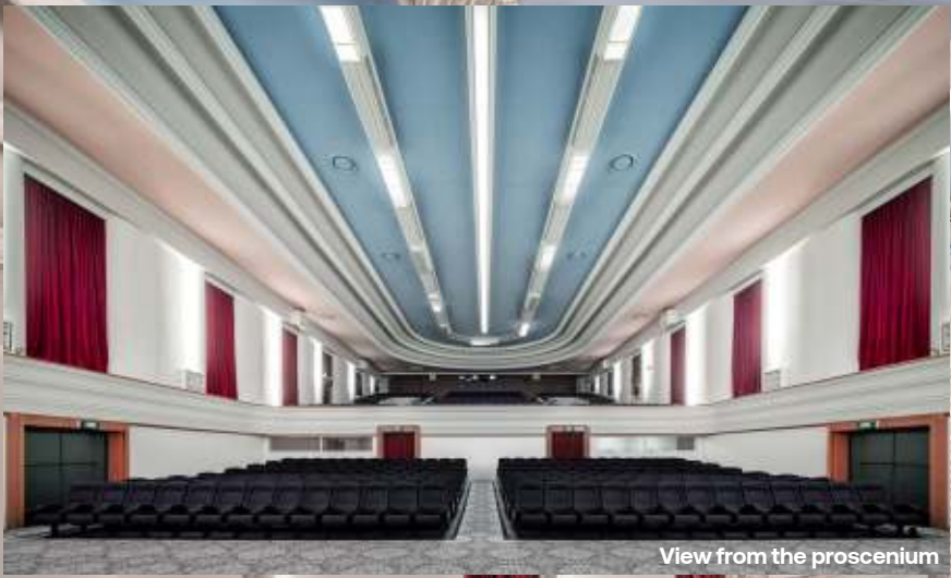
View from the proscenium