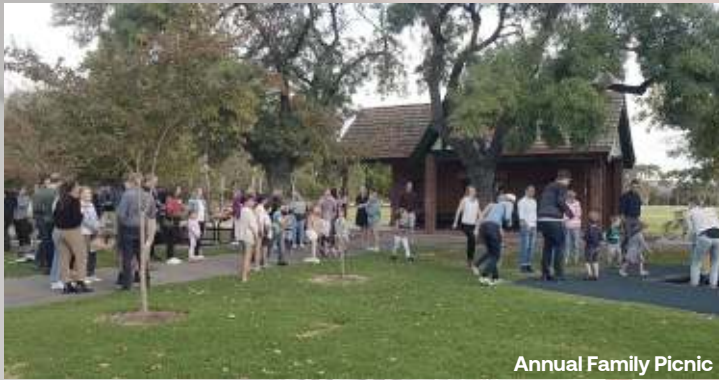
Annual Family Picnic