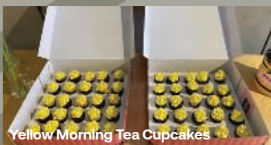
Yellow Morning Tea Cupcakes