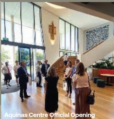
Aquinas Centre Official Opening