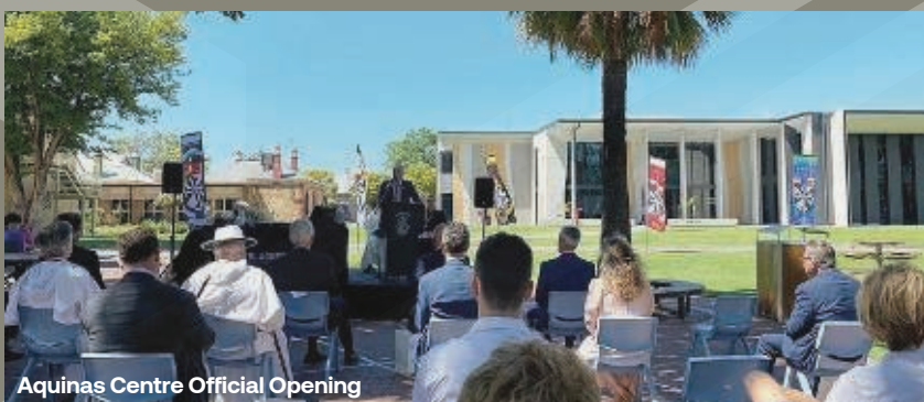
Aquinas Centre Official Opening