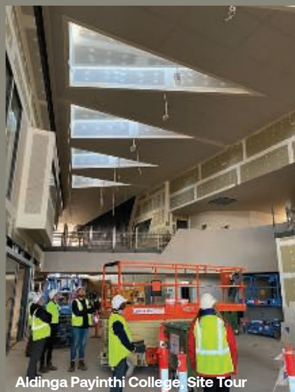
Aldinga Payinthe College, Site Tour