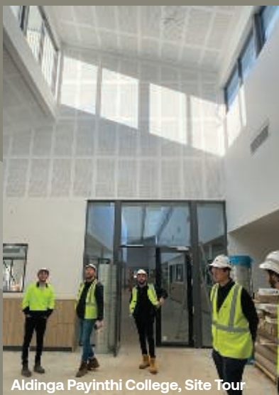
Aldinga Payinthe College, Site Tour

On September 9th, we held a yellow themed morning tea, for R U OK? Day. It was a bright morning with staff clad in all kinds of yellow. It was an opportunity for the office to come together, stay connected and check in with one another. Donations were collected on the day in aid of UniSA's Mental Health Research fund.