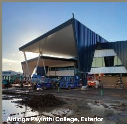
Aldinga Payinthe College, Exterior