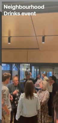
Neighbourhood Drinks event