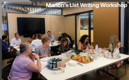
Marion's List Writing Workshop