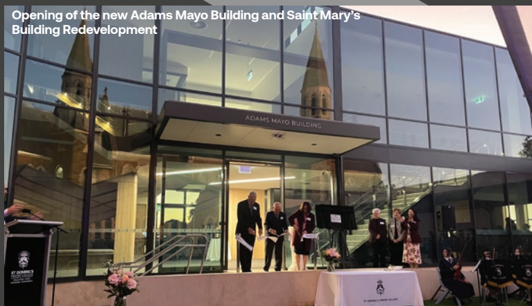
Opening of the new Adams Mayo Building and Saint Mary's Building Redevelopment