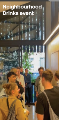
Neighbourhood Drinks event