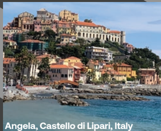
Angela, Castello di Lipari, Italy