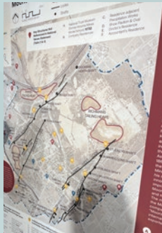
SP maps & Conservation Management Plans