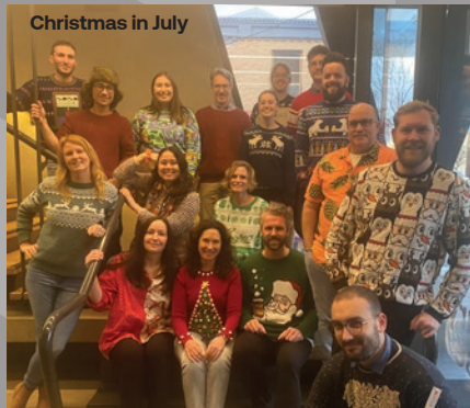
Christmas in July