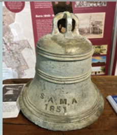
Burra, Burra Copper Mine bell

Swanbury Penglase had a good showing at this event, with several of our Heritage team members in attendance. An information booth introducing the World Heritage Bid for the Cornish Mining Sites at Burra and Moonta included our Conservation Management plans and maps for both sites. It was fantastic to see our work being presented to an international audience, especially the Conservation Management plans that are so often under appreciated for the effort that they require to produce.