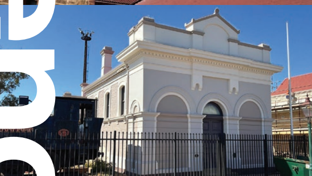
New paint scheme for the former Customs House