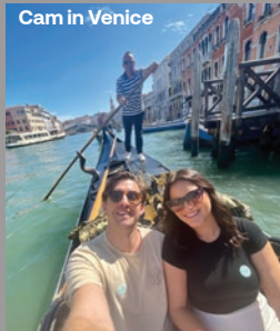
Cam in Venice