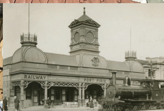
Port Pirie Railway Station, c.1930