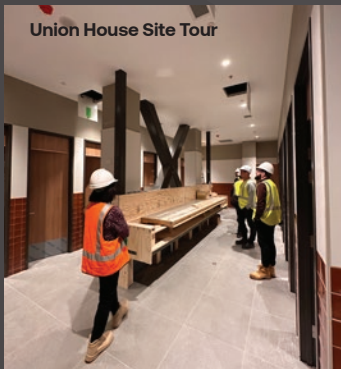
Union House Site Tour