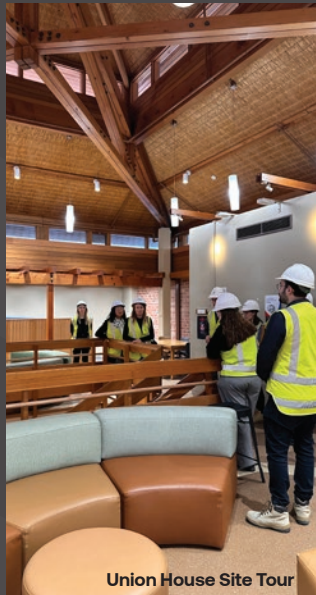
Union House Site Tour