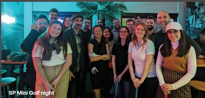
SP Mini Golf night