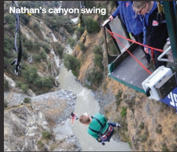
Nathan's canyon swing