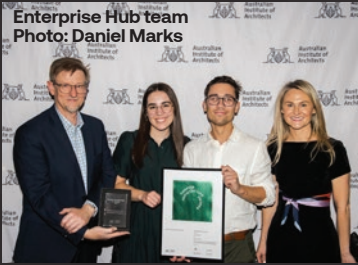
Enterprise Hub team