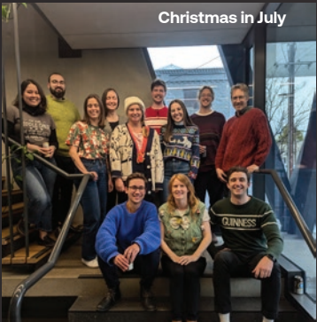
Christmas in July