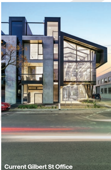
Current Gilbert St Office