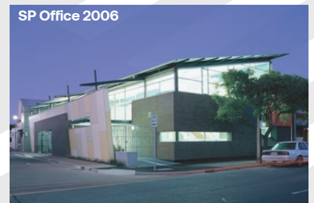
SP Office 2006