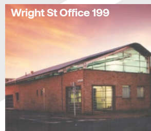
Wright St Office 199