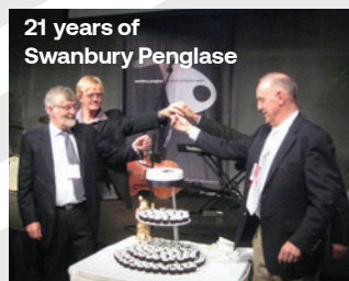
21 years of Swanbury Penglase