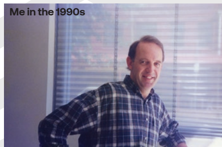
Me in the 1990s